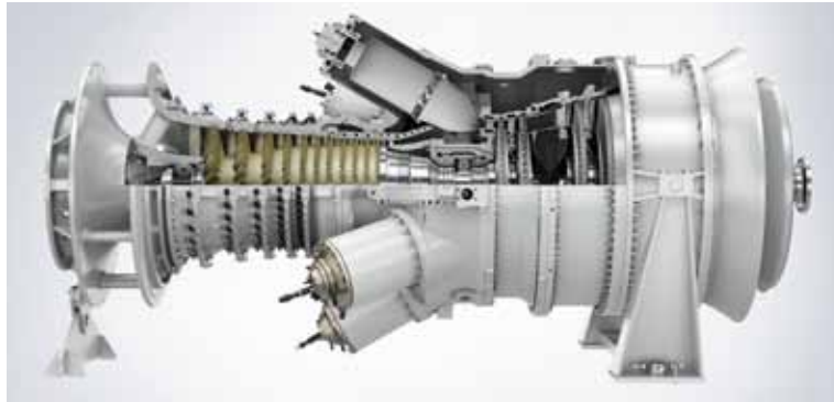
Twin-shaft design for both power generation and mechanical drive applications