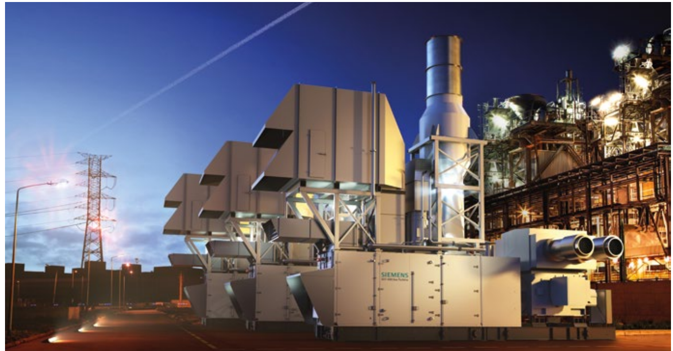
The SGT-400 is available as a factory-assembled package

Combined heat and power plant Customer: SEAT S.A. Scope: 1 × SGT-400 gas turbine package