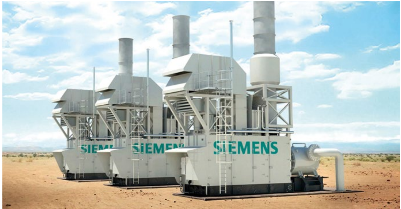
The SGT-300 twin-shaft version is used for mechanical drive

Over 150 units have been sold, with more than 5.6 million equivalent operating hours.