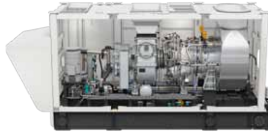
SGT-300 gas turbine package design

Power generation: 7.9 MW(e) Mechanical drive: 8.4 / 9.2 MW